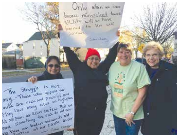
Associates rally for immigrant youth in the Back of the Yards section of Chicago.