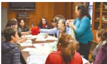
Associates beginning a prayer shawl ministry for women of Holy Cross - Immaculate Heart of Mary Parish, Chicago.

Associates are coming to the Assembly from the Midwest, northeast and southern United States. At this and other gatherings they meet and deepen their connections with each other. Your generosity supports our Associates as they come together to plan for their future. Thank you!